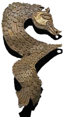
Roman

The trust has four places of study, 2 in Torbay and 2 in Dorset and we are about to start looking at a third in Torbay very soon, when lockdown has been eased. We conduct our work under license from the Marine Management Organisation and we have assisted them in shaping the seahorse licenses and their advice for anyone wanting to work with seahorses in the wild. Seahorses have been part of the UK for a very long time and the Romans modeled them out of gold to be put onto sword scabbards. The Pictish tribes of Scotland carved them on to stone statues back in the third and fifth centuries.