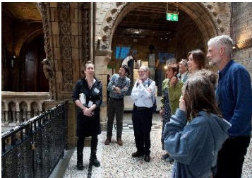
History & Architecture of the NHM