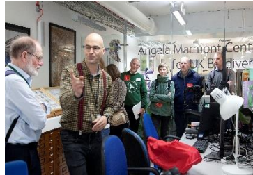
The Angela Marmont Centre for Nature