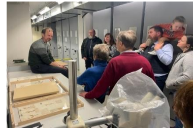
British & Irish Herbarium