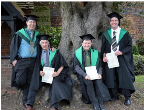
New MBNAs and (left) a Recipient of the Richard Fitter Memorial Medal in 2015

To this end the Association instituted graded membership on a three tier basis in order to formally award and recognise specific levels of knowledge and achievement in natural history. Members are encouraged to share their knowledge and through its grading scheme, recognises the gaining of relevant field skills and expertise. This stimulates naturalists to further develop their own individual knowledge and demonstrates to others you believe in furthering the study of natural history.