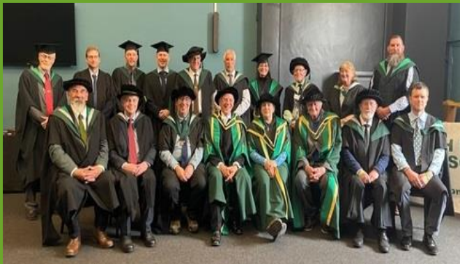
Graded members and guests 2019 BNA National Conference