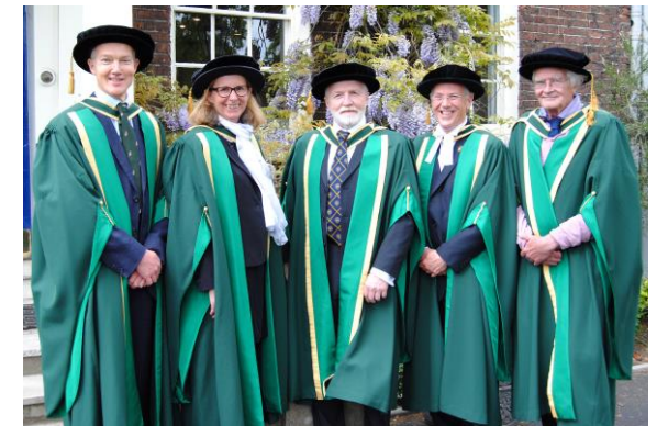
BNA conference 2017

To promote due recognition of excellence in and study of natural history, the Trustees established a Fellowship Honoris Causa which is bestowed on a strictly limited number of eminent naturalists of outstanding calibre.